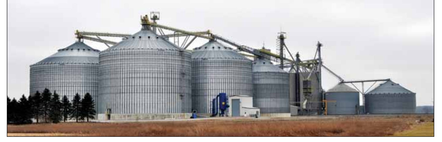
Sunrise Cooperative's 8.4-million-bushel rail terminal at West Clarksfield, OH. A new Behlen 1.1-million-bushel steel tank is the foremost tank in the photo, and a new 1,000-bushel receiving pit with Donaldson-Torit baghouse dust control system is visible in the center of the photo.

Operating three large rail terminal elevators, covering a wide swath of north central Ohio, and handling 50 million bushels of grain annually, Sunrise Cooperative often finds itself needing to make facility improvements.