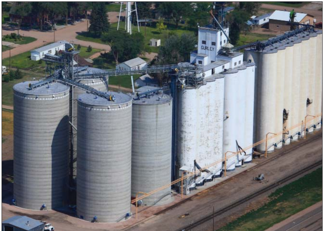
Crossroads Cooperative added three new McPherson Concrete jumpform tanks (left) at its location in Gurley, NE.

A grain elevator has been in operation in Gurley, NE since 1916. In 1988, Crossroads Cooperative, headquartered in Sidney, NE, purchased that elevator and in 2012 increased its storage capacity by 1 million bushels by adding three hopper-bottom McPherson Concrete jumpform tanks.