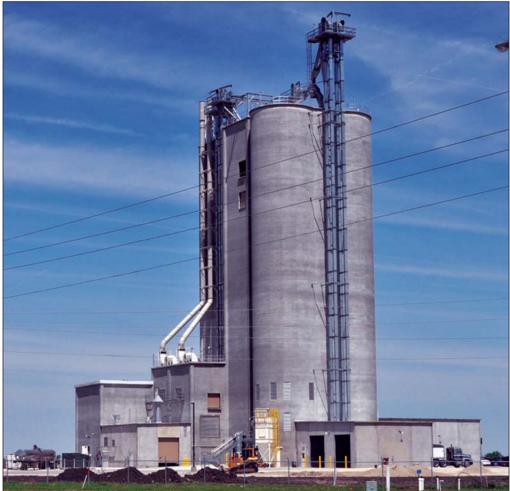
Cargill Pork's new $29 million 350,000-tpy swine feed mill at Hedrick, IA, part of a $60 million pork production investment Cargill is making in southeastern Iowa.

Air compressor .....Ingersoll Rand Automation system ....Repete Corp. Bearing sensors .....4B Components Ltd. Bin level monitors .. BinMaster Level Controls Boiler .....Cleaver Brooks Bucket elevators ..... InterSystems Contractor .. Younglove Construction LLC Distributor .. Hayes & Stolz Ind. Mfg. Co. Inc. Dust collection system .....Air-Con Corp. Elevator buckets .....Maxi-Lift Inc. Engineering ..... Younglove Construction LLC Hammermills ..... Andritz Inc. Magnets ..... Puritan Magnetics Inc. Manlift .....Schumacher Elevator Co. Mass flow meters .. Endress+Hauser Microingredient system ..... InterSystems Mixer .....Scott Equipment Co. Motion sensors .... Maxi-Tronic Inc. Pellet cooler .... Geelen Counterflow Pellet mills ..... Andritz Inc. Scales .....Mettler Toledo, LLC Rice Lake Weighing Systems Screeners .....Rotex Global LLC Screw conveyors .... Anderson Crane