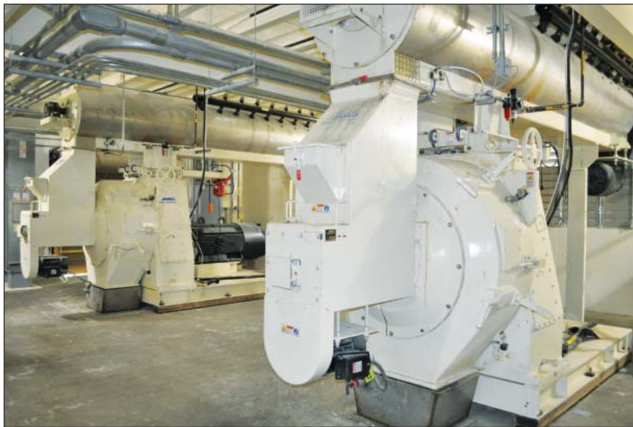
Two Andritz pellet mills produce pelleted feeds at a total of 80 tph.