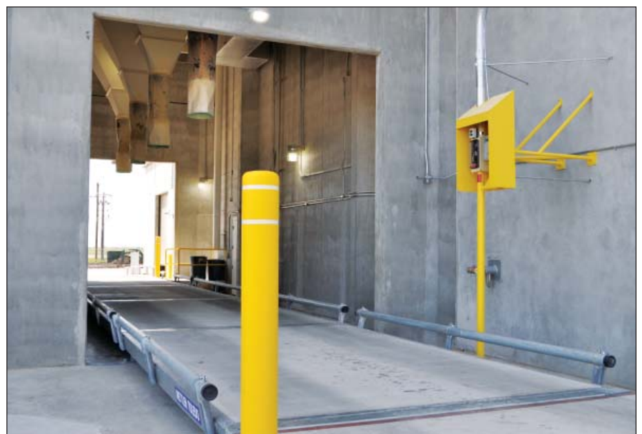
Loadout bay and METTLER TOLEDO truck scale are designed to load up to 60 feed trucks per day.