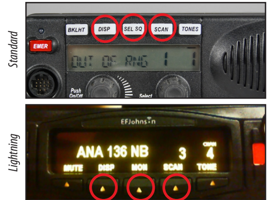
Fig. 3: Depress the indicated buttons at the same time to change the head address