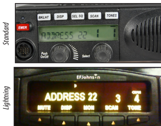
Fig. 4: After depressing the buttons, the current address will be displayed (address 22 shown)