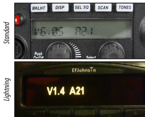
Fig. 1: Radio indicating Address 21 (A21)

At power up, the control address is shown next to the Control Head Firmware version.