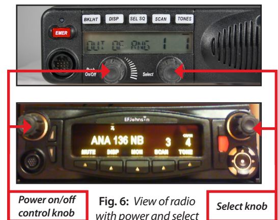
Power on/off control knob

Once you have the correct address selected and you depress the select knob to confirm the changes (Figure 6), power must be cycled on the radio to store the settings; Cycle Power is indicated on the display as shown in Figure 7. Once power is cycled, the radio will power up with the address set to 21 and audio should be restored.