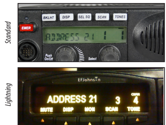
Fig. 5: Rotate the select knob (shown in Figure 6) counterclockwise to change the address to 21, then PRESS the knob