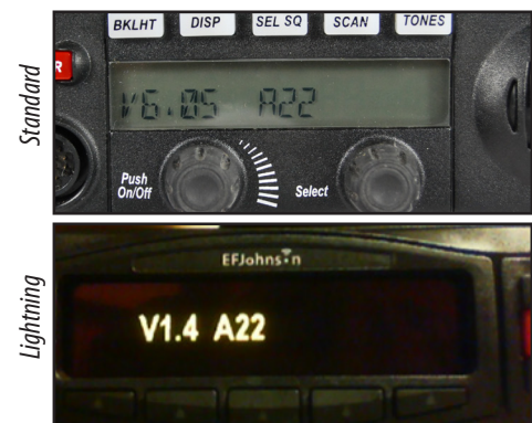
Fig. 2: Radio indicating Address 22 (A22)

Most, if not all, of the affected radios were shipped with the address set to 22, as indicated in Figure 2.