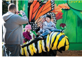
Lincoln Children's Zoo 1222 S 27th St

The next adventure will take on a behind the scenes tour of the Lincoln Children's Zoo . The Lincoln Children's Zoo is home to over 10 acres of land and 400 animals, 40 of which are endangered. This tour is guided by a Zoo expert and will give you exclusive access to areas such as the Penguin Care Center, Abel Horse Stables, Abbott Animal Care Center and other unseen areas.