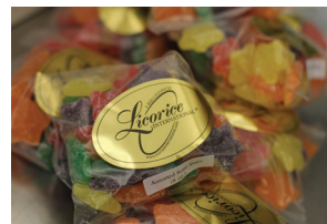
Licorice International 803 Q St #300